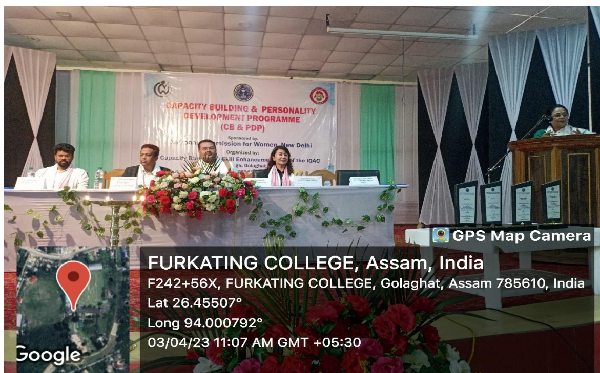
The Inaugural Session