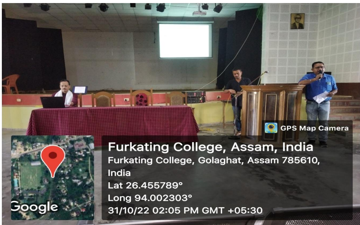
The Inaugural Session