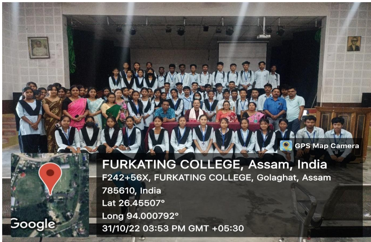
A Group Picture